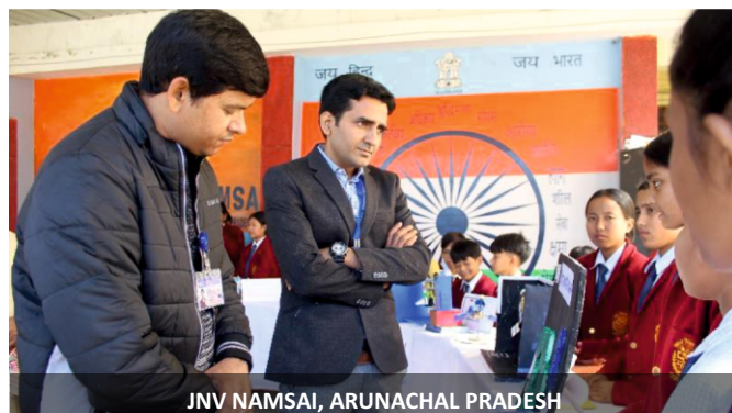
2-WAY EXCHANGE Gaining awareness on Students' Aspirations, Spreading Awareness on DAE Societal Technologies