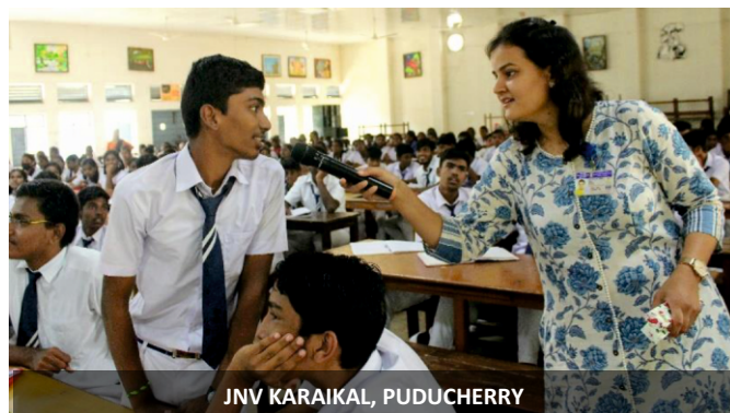
SCIENTISTS AS PARMANU MITRA Young scientists from BARC as the Ambassadors of Atomic Energy