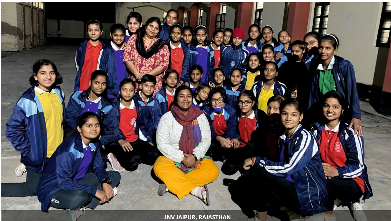
THE POWER OF INFORMAL BONDING Effective Engagement with Students, Overnight Stay at Schools