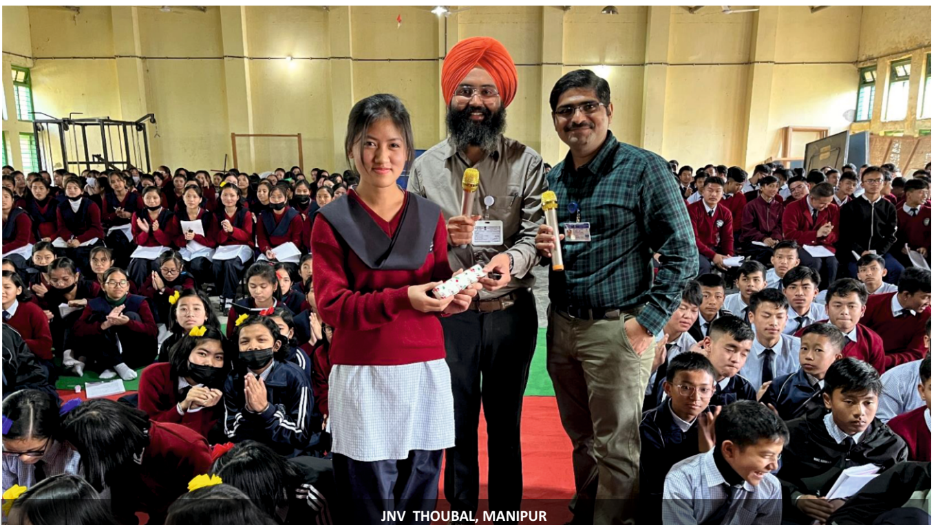
JNV THOUBAL, MANIPUR