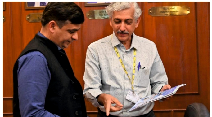
COMMISSIONER NAVODAYA VIDYALAYA SAMITI Calls on Secretary DAE to Discuss the Way Forward