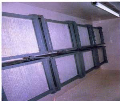
HEPA filters installed in filter mounting frame

non-nuclear industries. A working group of HEM-99 went through all the existing designs of such frames from the point of standardisation. Based on the feed back