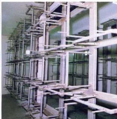
Typical filter mounting frame in a filter house

Various designs of filter mounting frames exist in nuclear installations, apart from those in