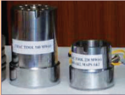
Tool for holding Sensor