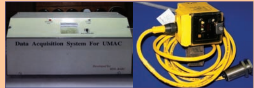
Data acquisition system