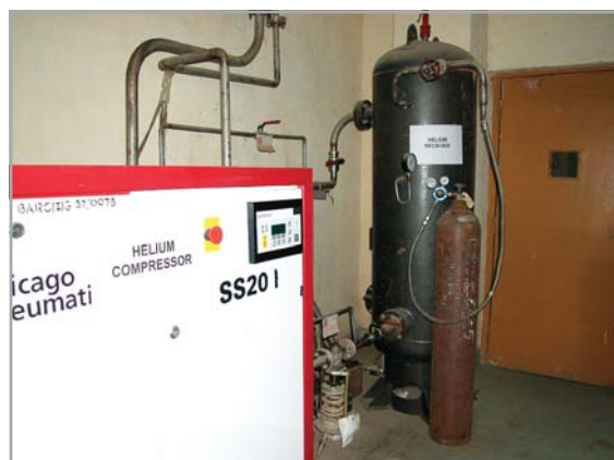
Air compressors modified for helium service are being used for laboratory test set-up