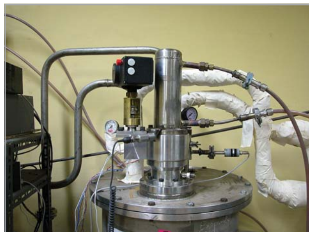
Turboexpander mounted on the test bench