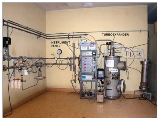
Laboratory test set-up built to test the performance of turboexpanders, efficacy of vacuum system, cryogenic insulation, indigenous temperature sensors and overall system performance and reliability