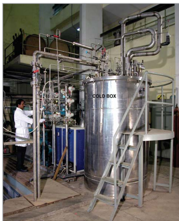
The prototype 1kW at 20K Cryogenic Refrigeration system developed and installed at BARC.

The operational tests revolve around measuring cool down time, lowest temperature reached, turbine speeds, vibration and overall system reliability. Preliminary tests conducted have enabled us to reach a lowest temperature of 14.9 K without any refrigeration load. The cryogenic system has been tested with a refrigeration load of 200 W at 16.5 K. The turboexpanders reached an operational efficiency of about 60% during loading.