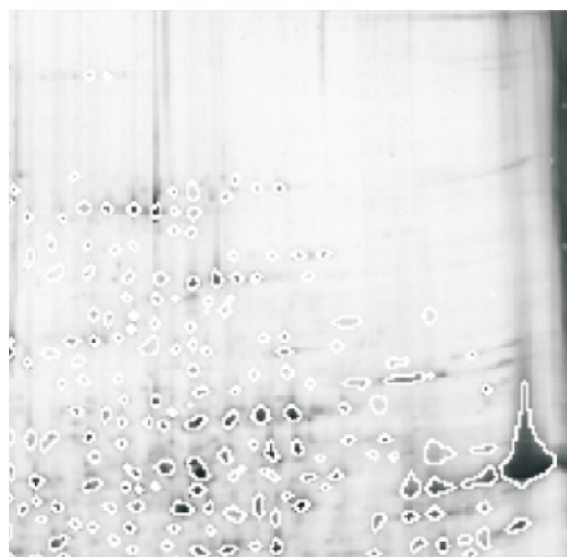
2DGE Image Analysis