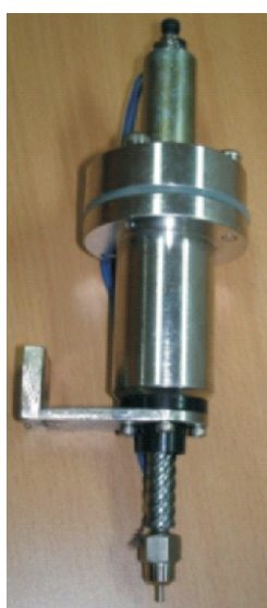
Protein Spot Cutting Tool