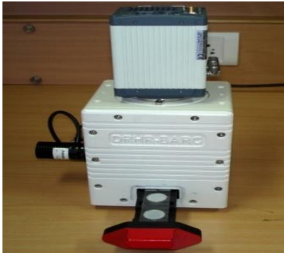
Portable Biochip Reader

Biochip reader is an indigenous portable device used to detect a very low light fluorescence signal of tagged patient sample from Biochip for early diagnosis of cancer.